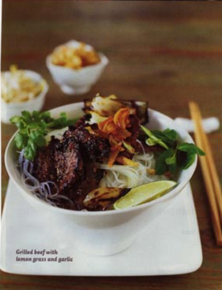
Grilled beef with lemon grass and garlic